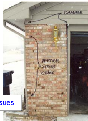
DAMAGE VERTICAL STRESS CRACK